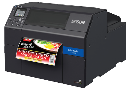
CW-C6500A 8" Auto Cutter