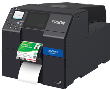
CW-C6000P 4" Auto Peel-and-Present

Epson offers the first color inkjet label printers with peel-and-present capability 5 , which can help speed up the manual application of on-demand labels. An integrated label-taking sensor holds off subsequent printing until the previous label is removed. This unique feature is ideally suited for fully automated label application systems. It also eliminates the need for a loose loop and allows individual labels to be taken as soon as they are printed.