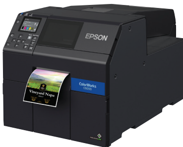
CW-C6000A 4" Auto Cutter

With a 4" or 8" built-in auto cutter covering the full spectrum of label sizes to create variable-length labels and enable easy job separation, these ColorWorks models offer cost and inventory reductions vs. using preprinted labels.