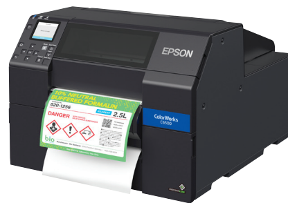
CW-C6500P 8" Auto Peel-and-Present