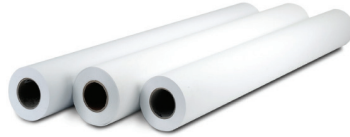
HP Production Satin Poster Paper, 3-in Core for HP PageWide Technology For the latest ICC profiles/paper presets, please visit HPLMedia.com/paperpresets .